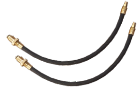
VAPIG- 500mm Vapour Pig Tail VAPIG1- 1000mm Vapour Pig Tail