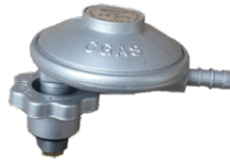
REGSS- Swivel (Cadac) 1.5kg /hr