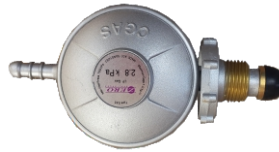
REGSB- Bullnose 1kg /hr