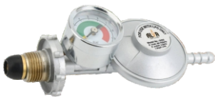
REGBWG- Bullnose Regulator with pressure gauge