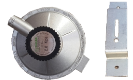
REGIN- 4kg 1/4 x 3/8F CGAS single stage Reg + Bkt inline