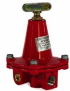
REG12/18KGHP- 12-18kg High Pressure adjustable Reg