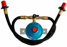
CHOCK- 4kg Change over complete including Reg, Valve and Pigtails