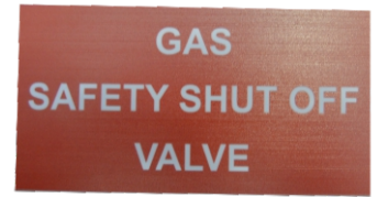
SAFSPV3 - Gas Shut off Valve 6,5cm x 12,5cm