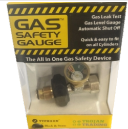
GSV- Gas Safety Shut off Valve with Gas level indicator