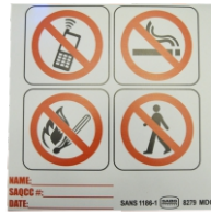
SAFSPV2 - Safety Signs 29cm x 29cm