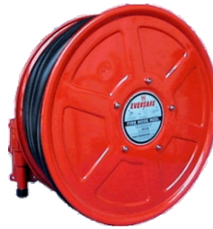
FIRRC - Fire Reel Complete