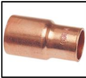
COPS1/4 - (6.35mm) Copper Straight COPS3/8 - (9.53mm) Copper Straight COPS1/2 - (12.7mm) Copper Straight COPSR3814 - 3/8" to 1/4" Copper Straight Reducer COPSR3812 - 3/8" to 1/2" Copper Straight Reducer