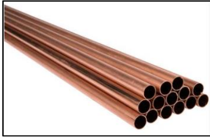
HARD DRAWN COPPER TUBING AVAILABLE EX JHB Relevant fittings available