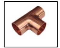
COPT1/21/2 - (12.7mm) Copper Tee COPT1/41/4 - (6.35mm) Copper Tee COPT3/83/8 - (9.53mm) Copper Tee