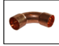
COPE1/4 - (6.35mm) Copper Elbow 90° COPE3/8 - (9.53mm) Copper Elbow 90° COPE1/2 - (12.7mm) Copper Elbow 90° COPE451/4 - (6.35mm) Copper Elbow 45° COPE453/8 - (9.53mm) Copper Elbow 45° COPE451/2 - (12.7mm) Copper Elbow 45°