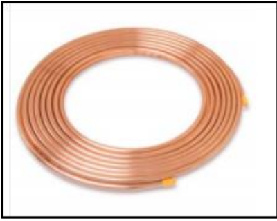
COTUS1/4 - 1/4" Copper Tubing 15.2M 6.35mm (Soft) COTUS5/16 – 5/16" Copper Tubing 15.2M 7.93mm (Soft) COTUS3/8 – 3/8" Copper Tubing 15.2M 9.53mm(Soft) COTUS1/2 - 1/2" Copper Tubing 15.2M 12.7mm(Soft)