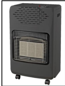
GHTRA - 3 Panel Roll-A-Bout Heater 9kg