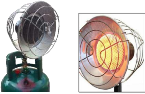
CYLTH - Cylinder top Heater