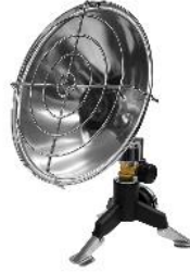
CYLTHCCR107 - Canister Dish Heater