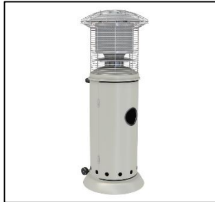
PATHSW - Short White Patio Heater