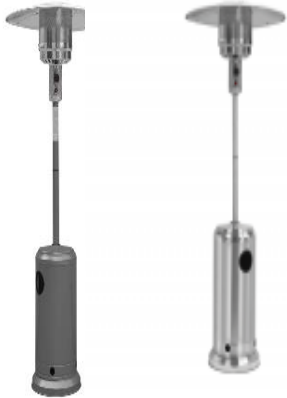
PATH - Patio Heater Powder Coated