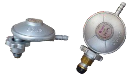
REGSS - Swivel (Cadac) 1.5kg/hr REGSB - Bullnose 1kg/hr REGBC - Cavagna Bullnose Regs 1kg/hr