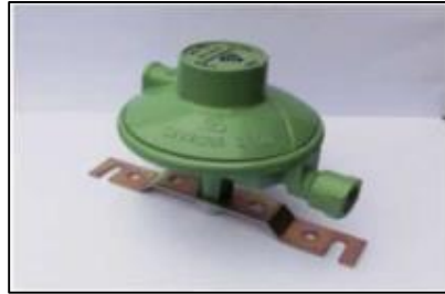
REGINC - 5kg Cavagna inline vented regulator and bracket