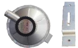
REGIN - 4kg inline vented regulator and bracket