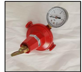
REG12/18KGHP - 12-18kg High Pressure adjustable Reg