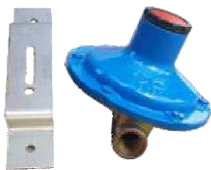
REGINA - 4kg Astro inline non-vented regulator and bracket