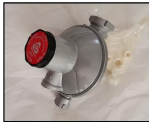
REG12LP - 12 Low Pressure Inline Regulator