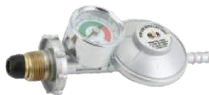
REGBWG - Bullnose Regulator with pressure gauge