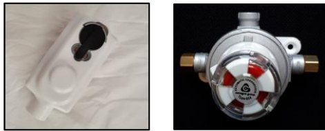
REGAUTOCO - Auto Changeover Regulator 2.8kpa 6kg REGAUTOCH - Auto Changeover First Stage Reg 10kg