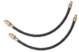
VAPIG - 500mm Vapour Pig Tail VAPIG1 - 1000mm Vapour Pig Tail