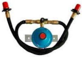
CHOCK - 4kg and 5kg Change over complete including Regulator, Valve and Pigtails