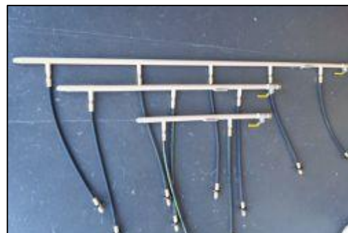
MANIFOLDS as requested:- Shed 80, 1/2" pipe cut and welded with sockets then fitted with pigtails, ball valves and bullnose adaptors Certificated