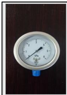
Gas Pressure Gauge 0-250kpa HP Gas Pressure Gauge 0-6kpa LP