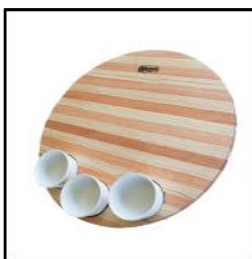
WBSRSB3 - Round Serving Board - 3 Bowls