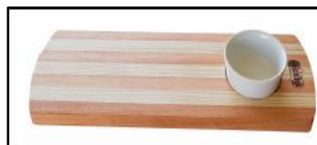
WBSB1 - Serving Board - 1 Bowl