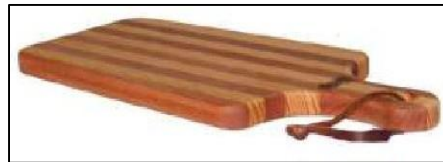
WFBB01 - French Bread Board (420mm x 520mm x 22mm)