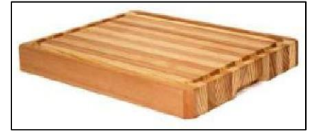
WCB001 - Chopping Board (330mm x 450mm x 39mm)