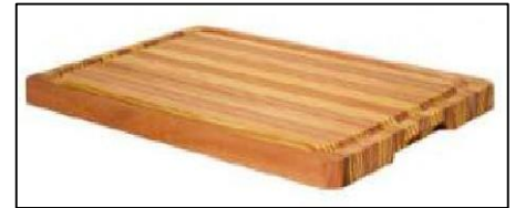
WSSB01 - Steak Board Small (285mm x 450mm x 23mm)