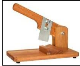
BCUT - Wooden Biltong Cutter