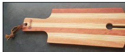
WBSAW - Wooden Snack and Wine Board