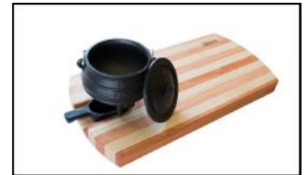
WBPKBB - Wooden Potjie Pot Board and Burner