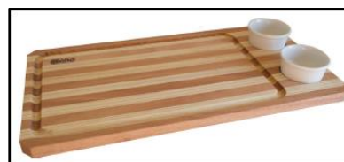
WBSB2 - Serving Steak Board - 2 Bowls