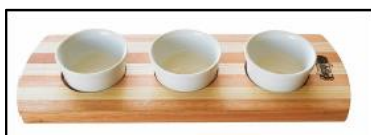
WBSB3 - Serving Board - 3 Bowls