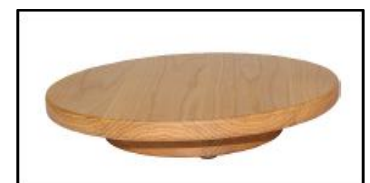
WBLS1 - Lazy Susan 400mm WBLS2 - Lazy Susan 450mm