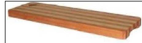
WGBB01 - Garlic Bread Board (198mm x 700mm x 22mm)