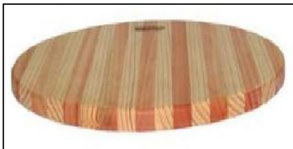
WBPB - Pizza Board (380mm x 22mm)